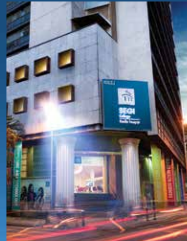
SEGi College Kuala Lumpur