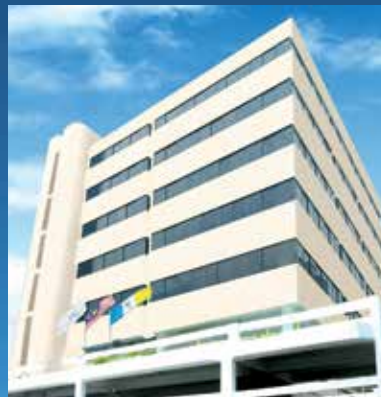
SEGi College Penang