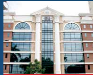
SEGi College Sarawak