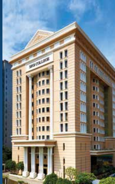
SEGi College Subang Jaya

SEGi is recognized as “The first Malaysian University that earned 5 Stars for prioritizing society’s needs in Malaysia” by QS Stars, an international evaluation system for universities based on auditing.